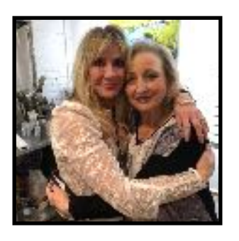
Some of the Charlotte artists with whom I work on a regular basis. I am blessed!