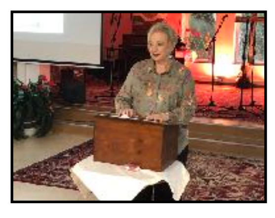
Leading A.C.T.-Europe Gathering, Alsace, France