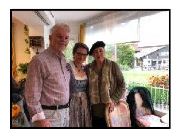
The owner of a Cafe/Bakery in Todtmoos, Germany who wanted to talk about forgiveness after reading my book.