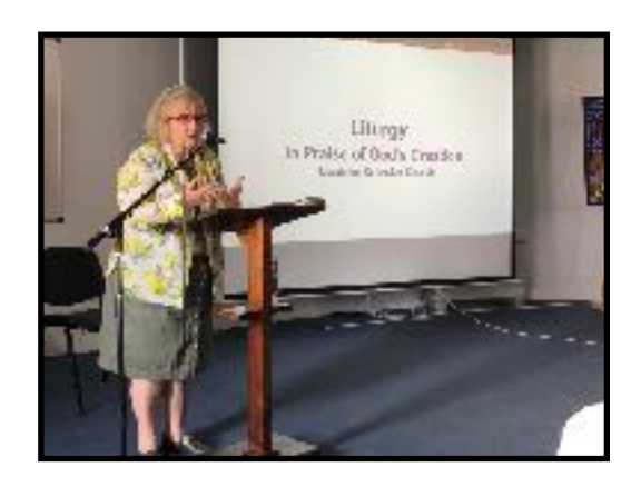
Leading Sunday Worship at Arts+Europe Conference, Sofia, Bulgaria