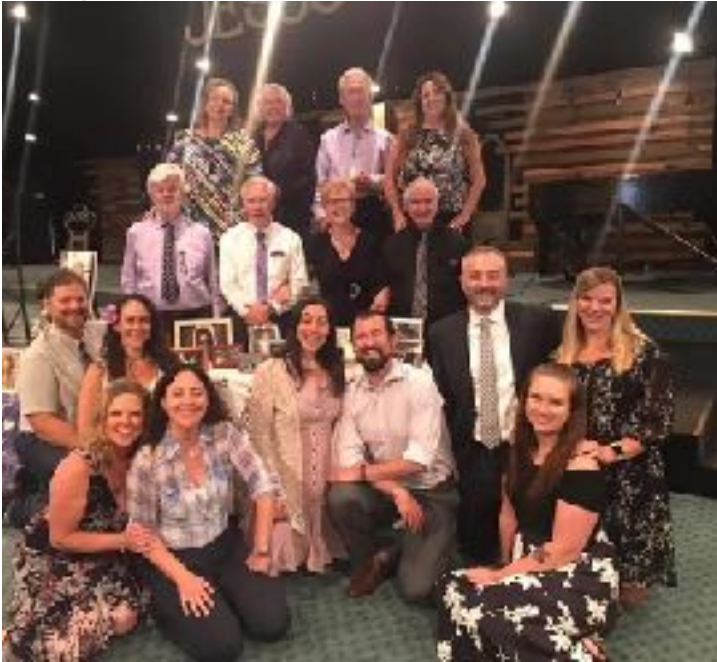
Extended Collard Family at Memorial Service